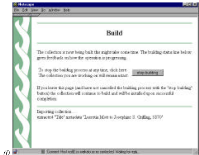
Figure 1 (continued)