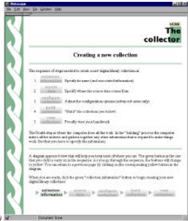
Figure 1 Using the Collector to build a new collection (continued on next pages)

License. The software includes everything described above: Web serving, CD-ROM creation, collection building, multi-lingual capability, plugins and classifiers for a variety of different source document types. It includes an autoinstall feature to allow easy installation on both Windows and Unix.