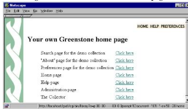
Figure 3 Your own Greenstone home page

Figure 3 shows an example of a new digital library home page. Each of the "Click here" links takes you to the appropriate Greenstone facility. This page was generated by the file called yourhome.dm shown in Figure 4.